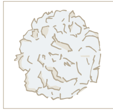
COCONUT MACARON ALMOND ICE CREAM WITH TOASTED FLAKES OF COCONUT