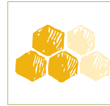
APPLES AND HONEY HONEY ICE CREAM WITH CHUNKS OF APPLE