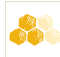
APPLES & HONEY