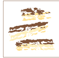
MATZOH CRUNCH VANILLA ICE CREAM WITH CHOCOLATE AND CARAMEL COATED MATZOH